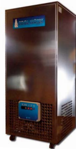
CW 100 / 200 / 300 / 500