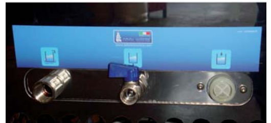
FITTINGS CONNECTIONS / SOLENOID