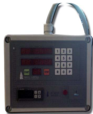
CONTROL PANEL CWR - D CWR - RD