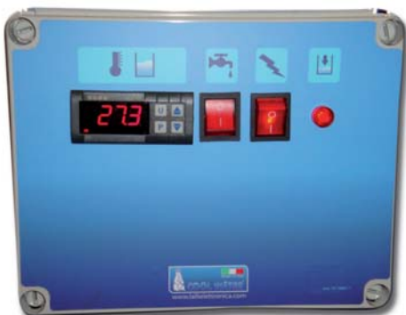
CONTROL PANEL CWR